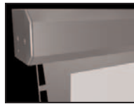
Luxus Model A